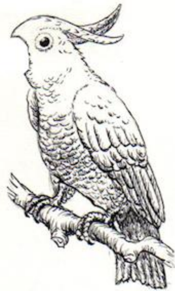
Sulphur Crested Cockatoo