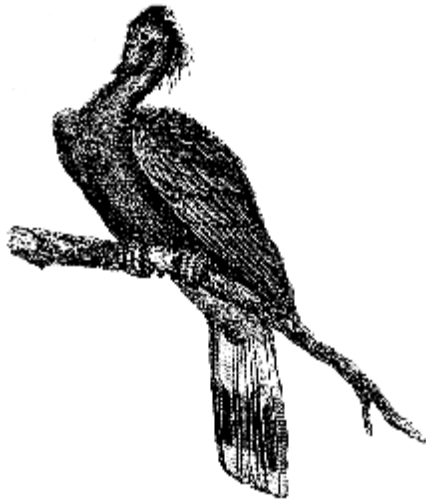
Silver Cheeked Hornbill

3) Use your pencil to draw the beaks back on these birds.